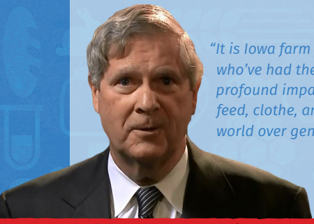
Tom Vilsack Agriculture Secretary

Many of the changes and inventions that influenced agriculture began from the minds of problem-solving Iowans. The exhibit may only bring awareness to twelve great Iowans, but visit our website, ittakesandiowan.com to learn about others.